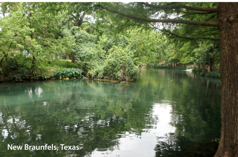
New Braunfels, Texas