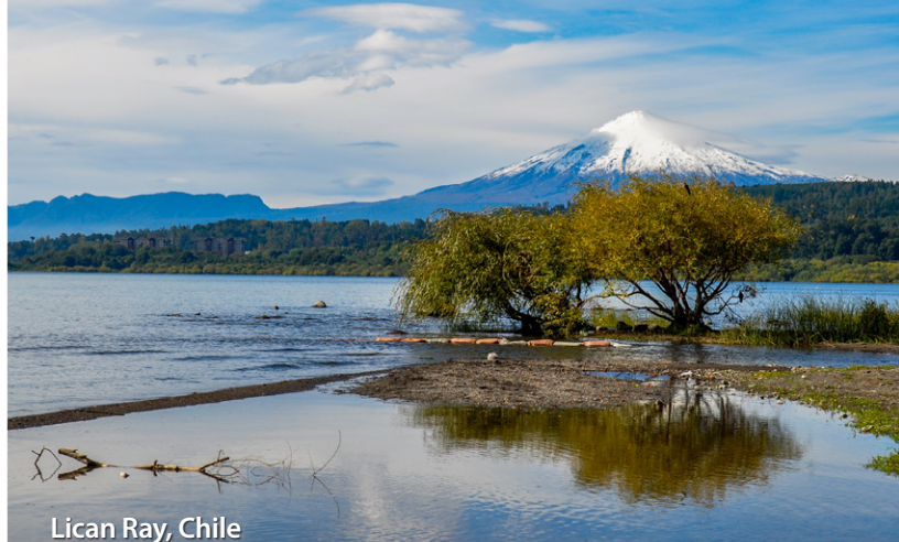
Lican Ray, Chile

Fragrance-controlled room available: No.