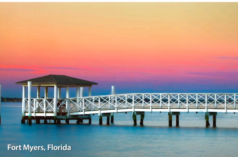
Fort Myers, Florida

For those interested in history, there are seven museums to visit and the historic district of Gruene (a district within the city of New Braunfels) to explore. And for dining, there are many restaurants nearby where visitors can sample German dishes, Texas barbecue and contemporary fare.