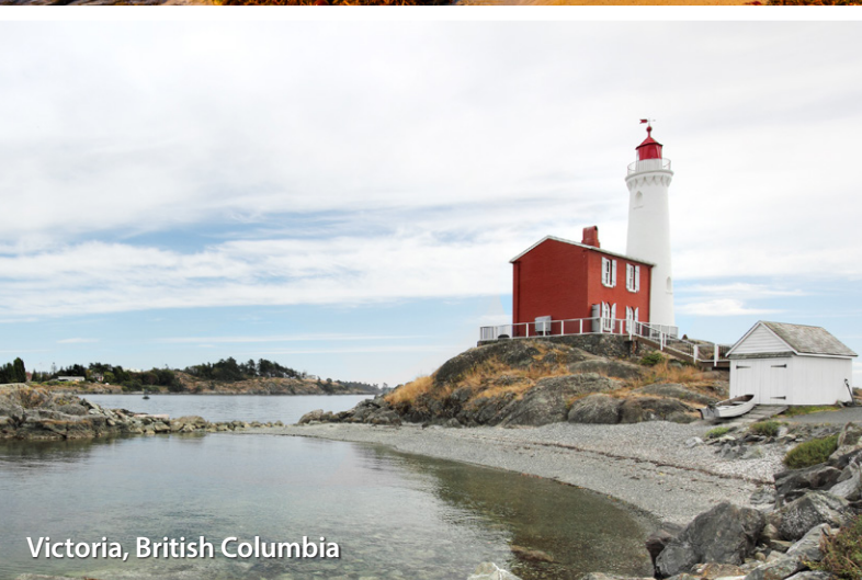
Victoria, British Columbia