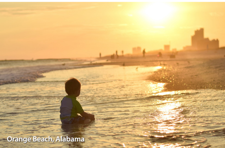
Orange Beach, Alabama