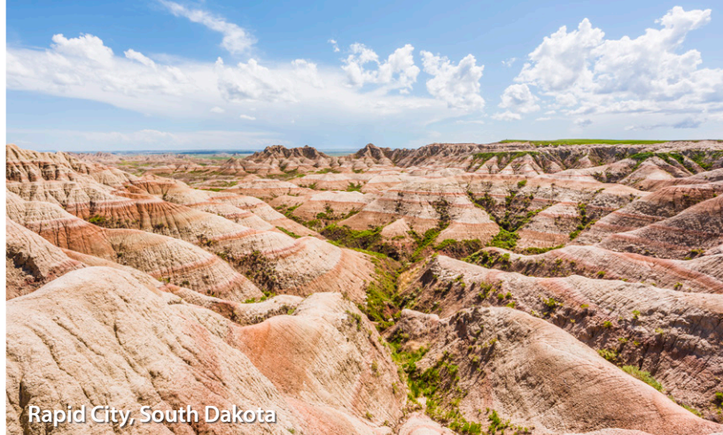
Rapid City, South Dakota