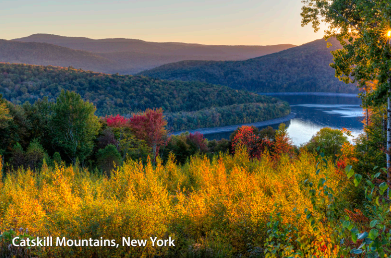
Catskill Mountains, New York