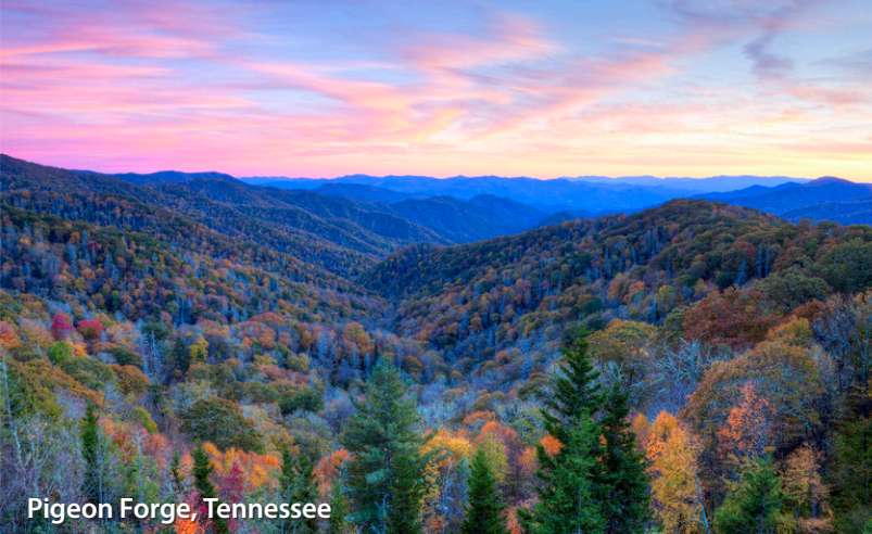
Pigeon Forge, Tennessee