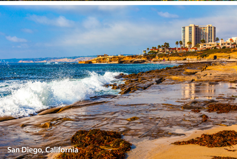
San Diego, California