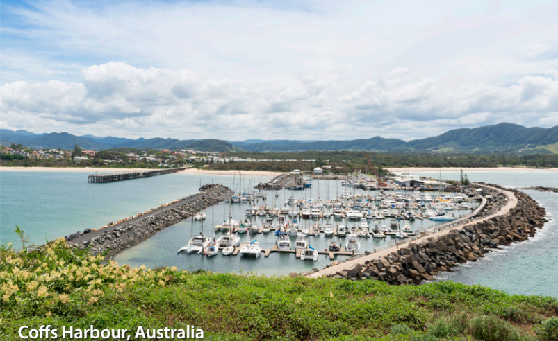
Coffs Harbour, Australia