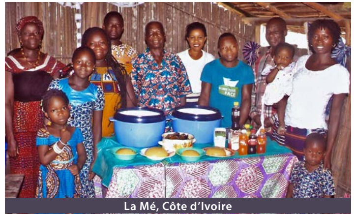
La Mé, Côte d'Ivoire