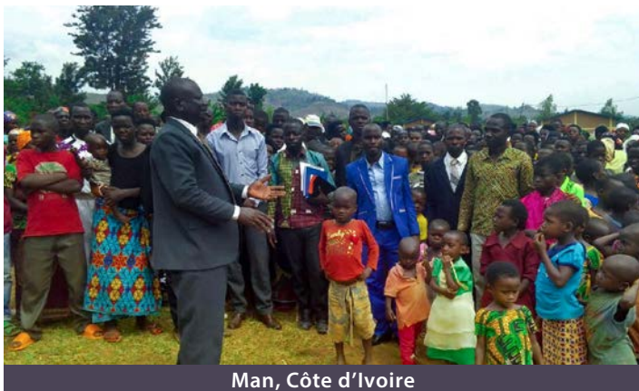
Man, Côte d'Ivoire