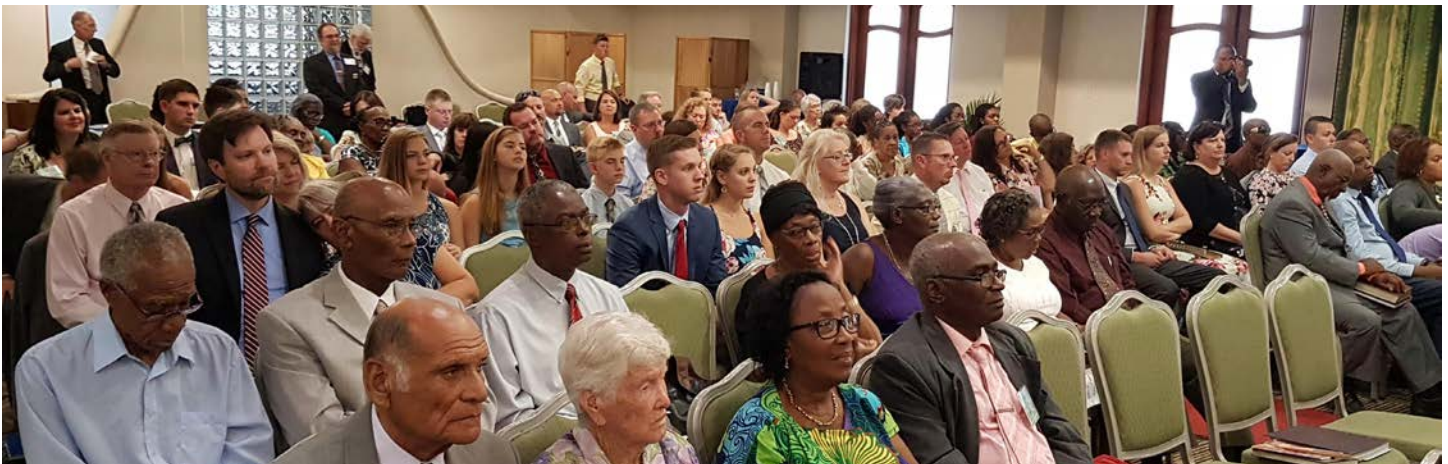
Christ Church, Barbados