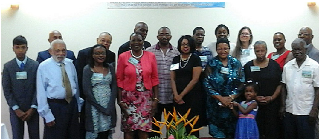
St. George's, Grenada