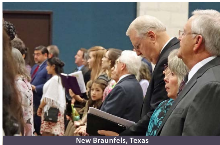
New Braunfels, Texas