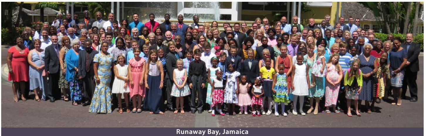
Runaway Bay, Jamaica

We enjoyed singing hymns and teaching each other varying melodies for some of the classics, playing football (soccer) and volleyball, playing cards, and just spending time talking with each other.