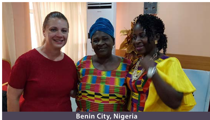
Benin City, Nigeria