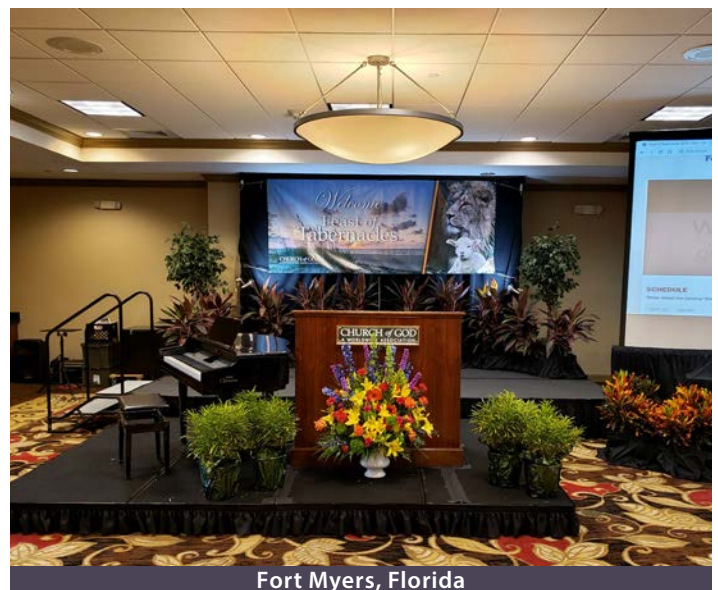
Fort Myers, Florida