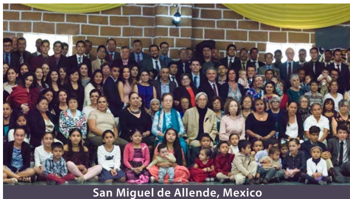
San Miguel de Allende, Mexico

The international flavor of the Feast at