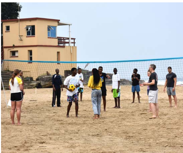
Uvongo, South Africa