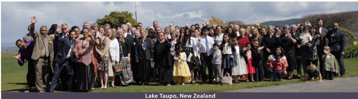
Lake Taupo, New Zealand

Lake Taupo added to the overall spirit of rejoicing and togetherness. Among the 99 present were members from the U.S., Chile, Australia, Zambia, New Zealand, Philippines, Fiji, Tonga and South Africa. Sermons focused on the dramatic positive changes that will take place once Christ sets up His Kingdom on earth.