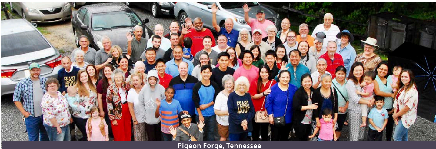
Pigeon Forge, Tennessee

Family Day is always a highlight here. This year we added new carnival games for the children and sports