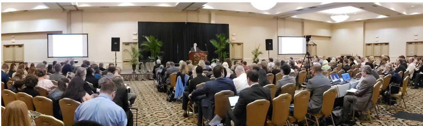
San Diego, California

activities for the adults. Two new sand volleyball courts were added by the city, just in time for our use.