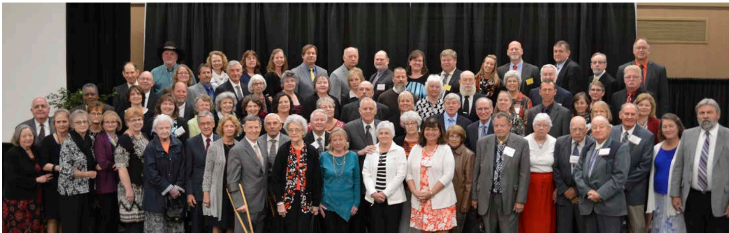
Rapid City, South Dakota

Nearly one third of those in San Diego went on the dinner cruise again, enjoying a wonderful meal and taking in the San Diego skyline at night. Families also enjoyed a wonderful opportunity to dance and fellowship at the Family Day activity.