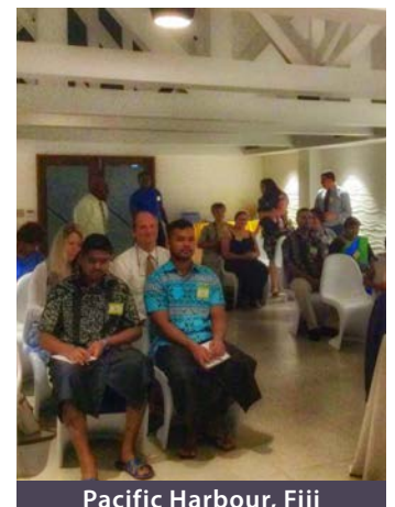
Pacific Harbour, Fiji