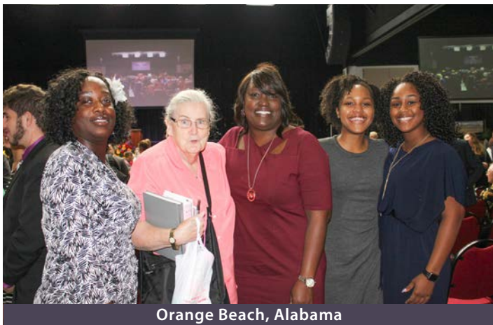
Orange Beach, Alabama