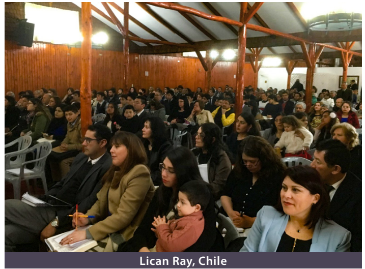
Lican Ray, Chile