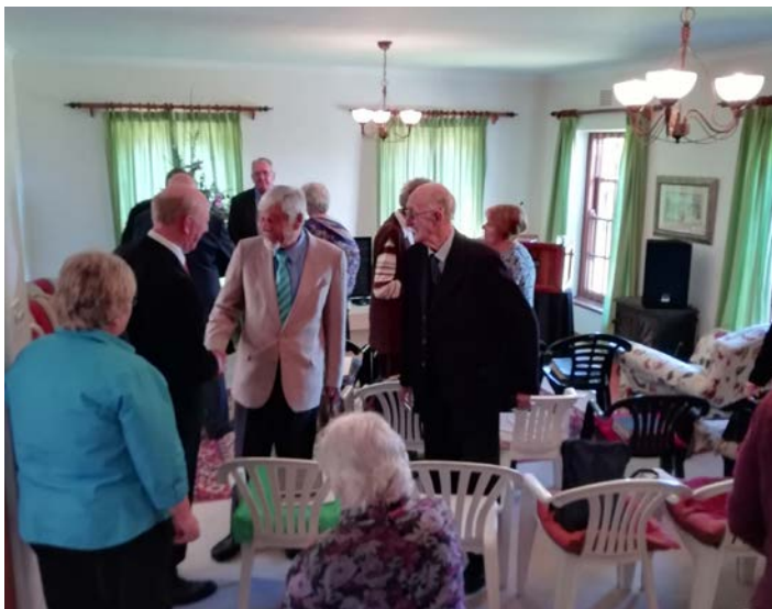
Ceres, South Africa