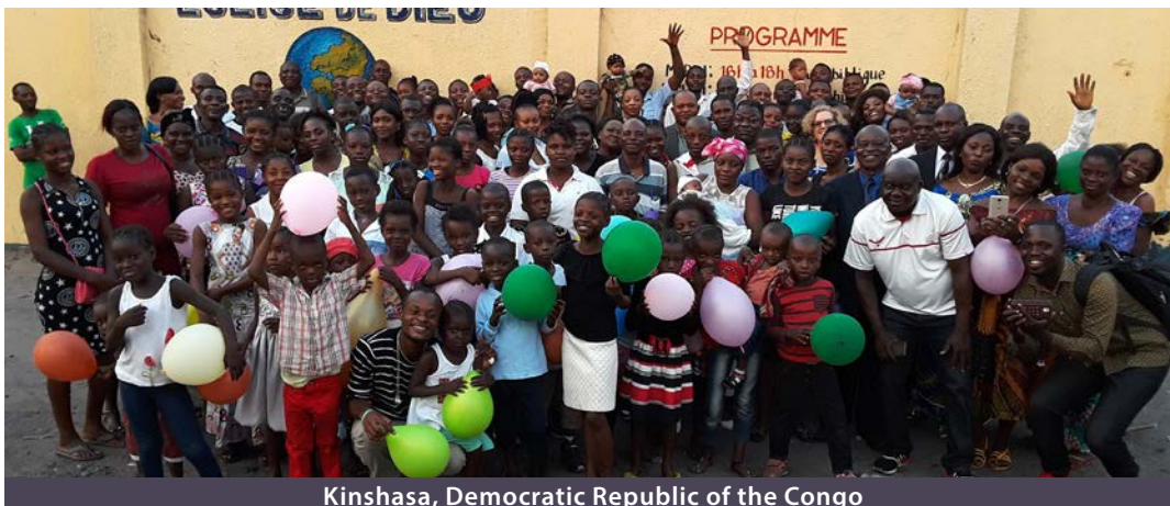
Kinshasa, Democratic Republic of the Congo