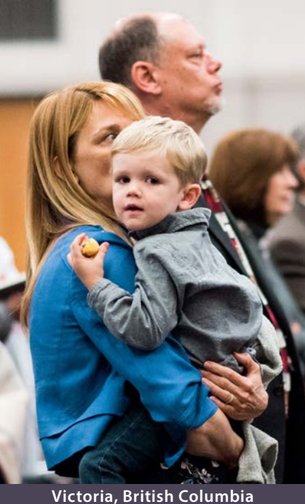
Victoria, British Columbia