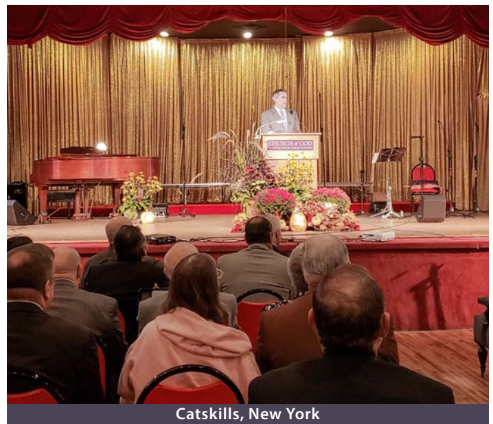
Catskills, New York

We had over 100 participants for the senior luncheon. Seniors enjoyed a buffet meal, live entertainment and a few encouraging words from