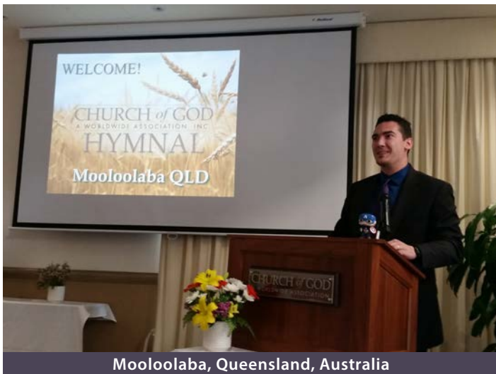
Mooloolaba, Queensland, Australia